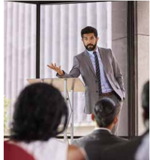
Guest Speakers and Industry Experts

350+ Student Mentors and Faculties for Quality training and service